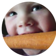
Hunger Through My Lens