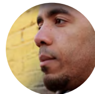
“Place Matters” by Clint Smith