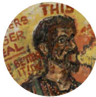
Hunger’s Wall: Tell It Like It Is