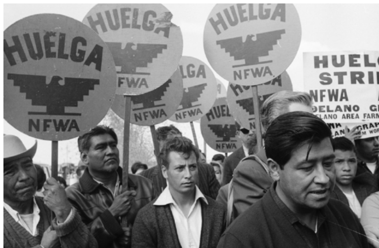
"Cesar Chavez walking with farmworkers carrying strike signs,"

* The examples above are a few selected examples of related resources and do not represent the full breadth of work on these issues.