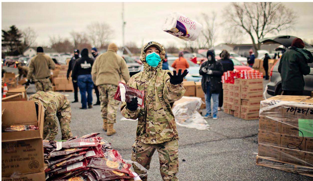
“Delaware National Guard”

However, the term food security can be limiting when positioned as an ultimate goal, rather than one of many desired outcomes, because it does not adequately address the nutritional or diet quality of available foods or any of the root cause structural issues that create inequities and food insecurity in the first place. While food security is a helpful indicator of progress towards a more equitable food system, it is one step towards food justice, food sovereignty, and an end to food apartheid.