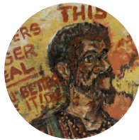
Hunger’s Wall: Tell It Like It Is