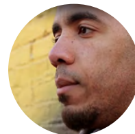
“Place Matters” by Clint Smith