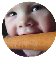
Hunger Through My Lens