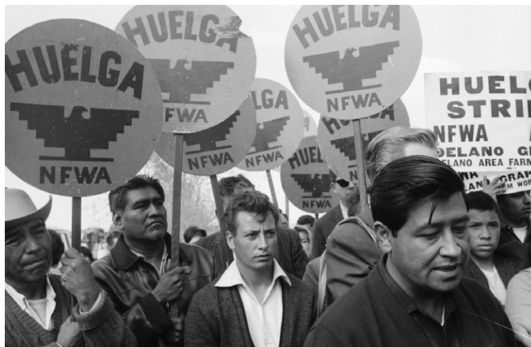
"Cesar Chavez walking with farmworkers carrying strike signs,"

* The examples above are a few selected examples of related resources and do not represent the full breadth of work on these issues.